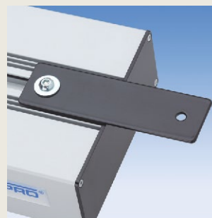
Mounting accessories included