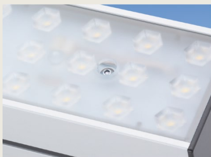
60° LED optic