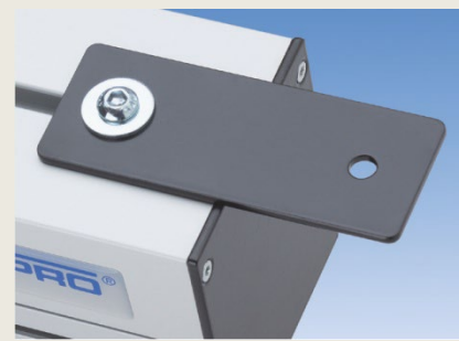
Mounting accessories included

– additional versions, accessories and spare parts upon request / subject to change and error –