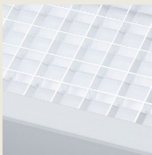
Parabolic louvre LED